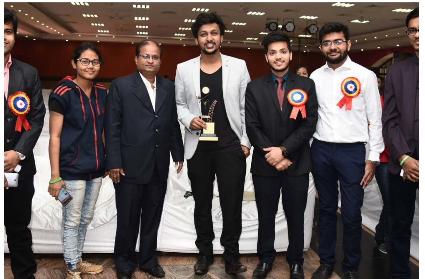
CICASA & ENTREPRENEUR OF THE YEAR, RAIPUR