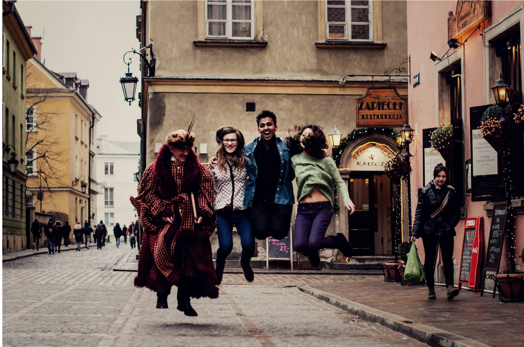
GLOBAL ENTREPRENEUR'S PROGRAM, POLAND